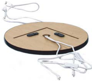
1. Thread light cords through circular base