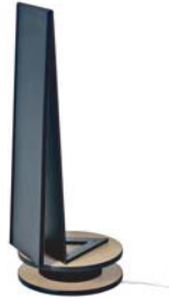
2. Attach hinge panel to triangle guide