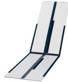
2. Unfold V-panel